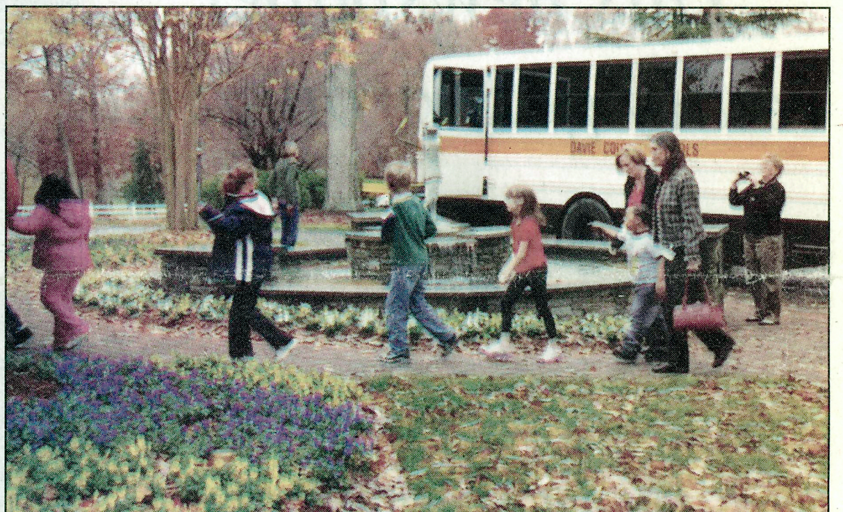
Children show their excitement as they enter the front doors of the country club.