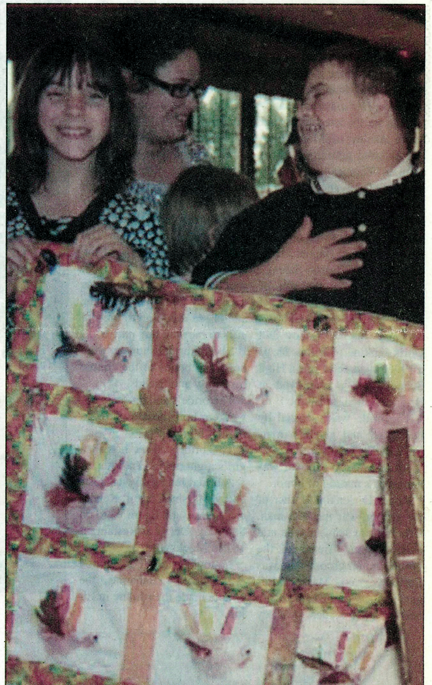
The students have some turkeys for the hosts.