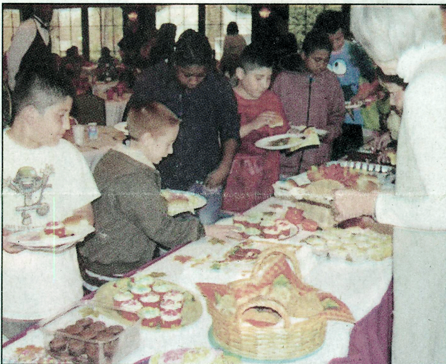
Students take advantage of the table filled with holiday goodies.