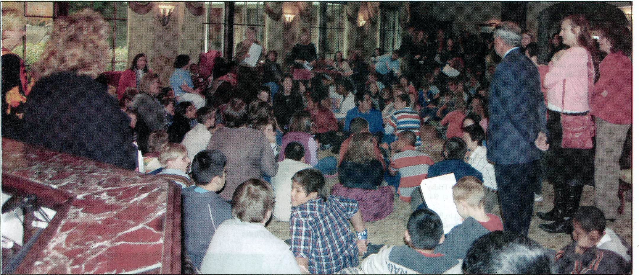
The Bermuda Run Country Club is filled with music as members of the Bermuda Run Garden Club host children from exceptional classes at Davie County Schools.