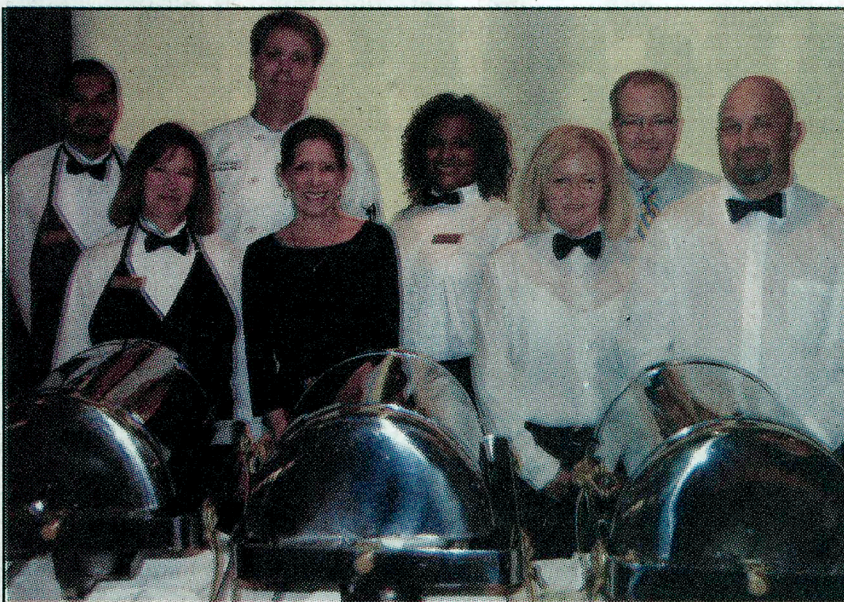
These members of the country club staff donated their time to make the day enjoyable for the students.