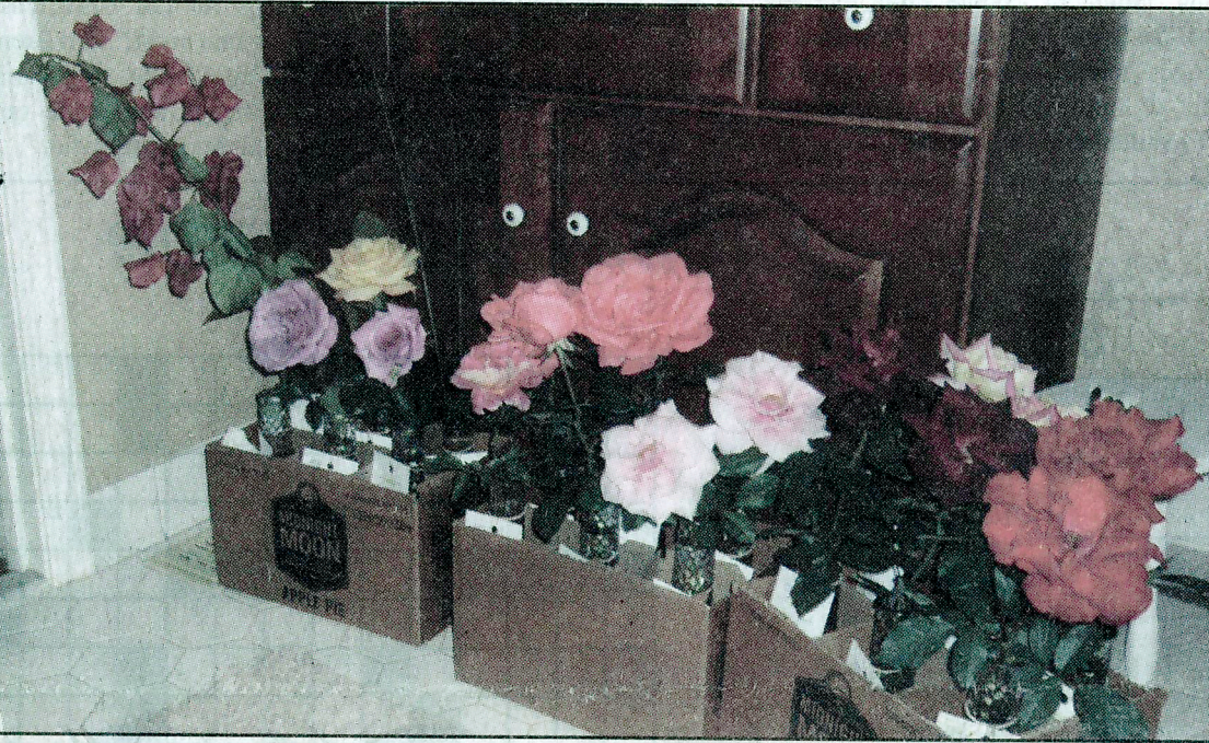
The roses are boxed and ready to take to the fair.