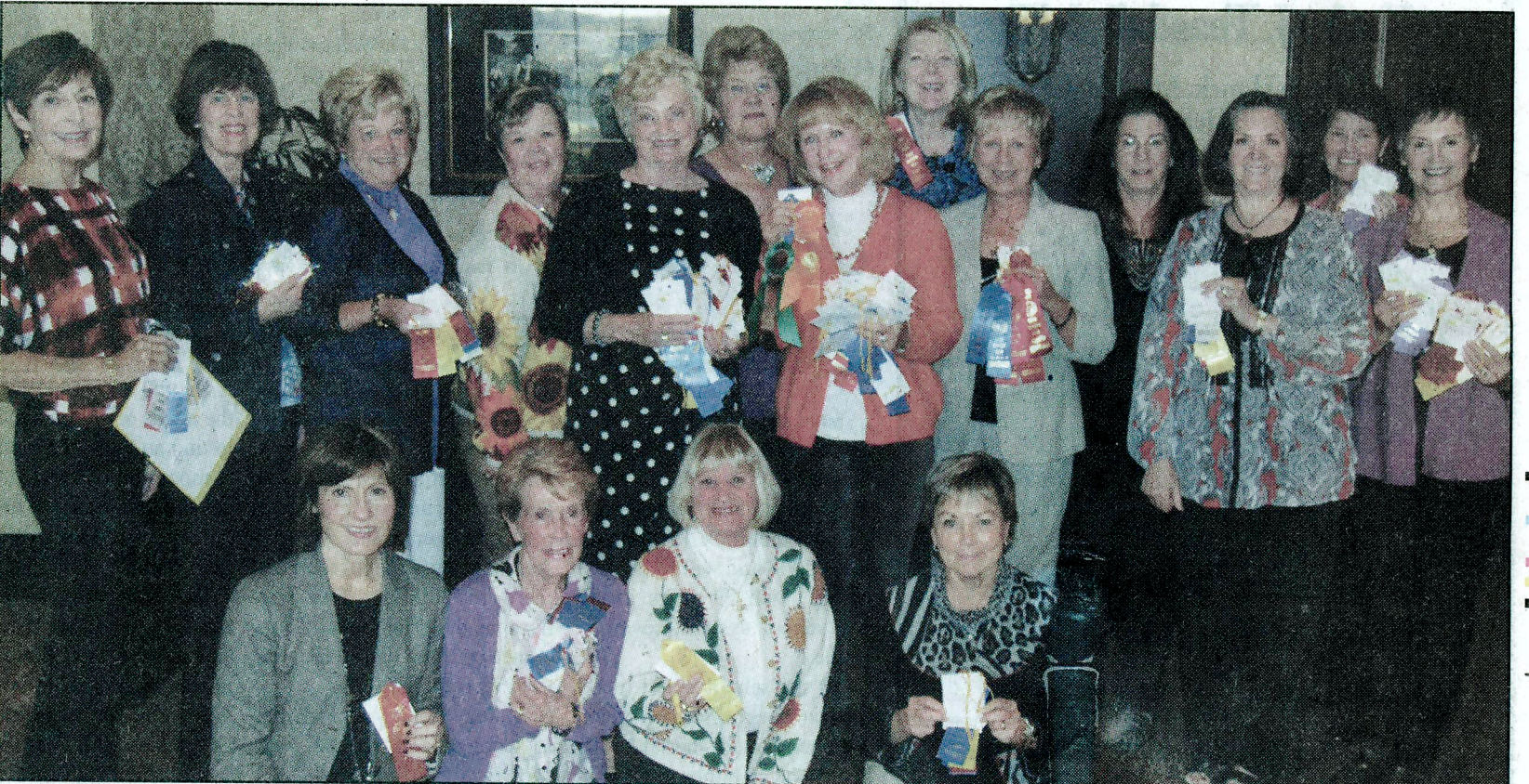
These members of the Bermuda Run Garden Club won ribbons at the Dixie Classic Fair.